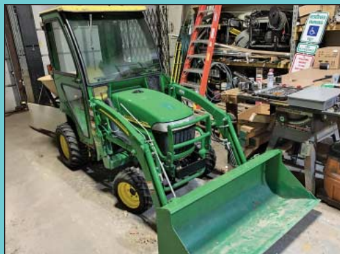
John Deere Model H120 Front Loader Attachment w/ Bucket