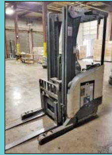
3,000 Lb. Crown Model RR5200 Electric Reach Truck