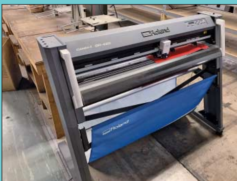
42" Roland Model GR-420 Vinyl Cutter