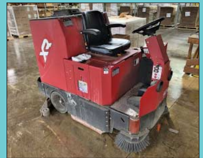
Factory Cat Model XR Electric Floor Scrubber