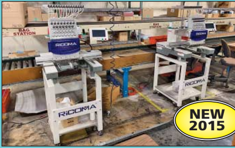
(2) RiComa Model RCM-1501TC-7S Embroidery Machines