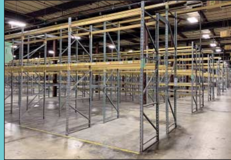
(1,085) Sections 42" Deep X 96" X 12'/14" High Penco Pallet Rack Some with Decking