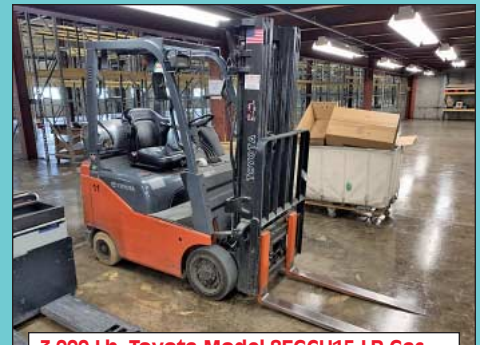
3,000 Lb. Toyota Model 8FGCU15 LP Gas Lift Truck