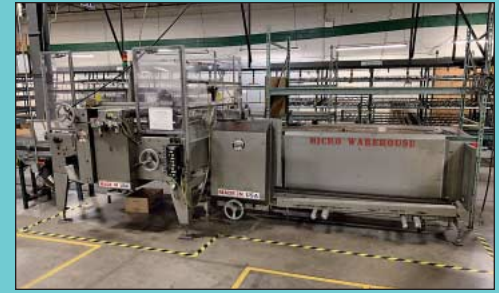
(4) Marq Model HPE-NS/RH/AB Case Erectors