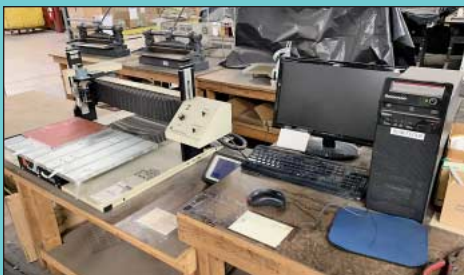
(5) Xenetech Rotary Engravers