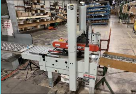
3M Model 700R/3 Case Sealer