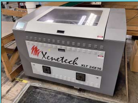
Xenetech Model XLT 24X36 Laser Engraver