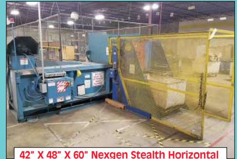
42" X 48" X 60" Nexgen Stealth Horizontal Closed End Baler