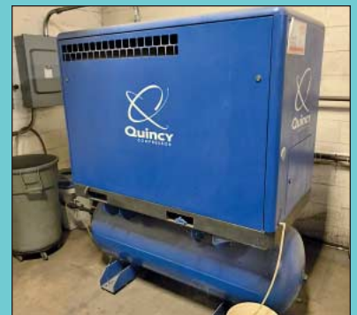
30 HP Quincy Model OGB-30 Air Compressor