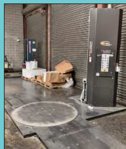
Wulftec Model WSML-200-S Stretch Wrapper