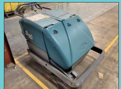
Tennant S10 Floor Sweeper