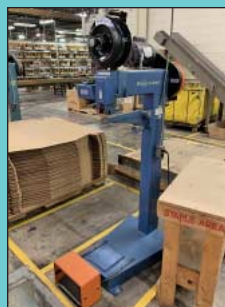
(3) Silvers Stitches Wire Stitchers