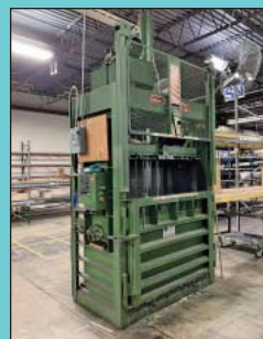
(2) 30" X 60" Philadelphia Vertical Hydraulic Balers