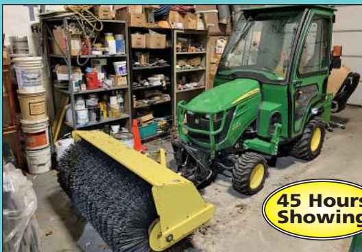
John Deere 1025R Tractor with 60 HD Broom and Counter Weight