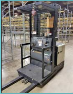
3,000 Lb. Crown Model SP3400 Electric Order Picker