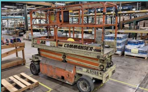
JLG Commander 2033 Electric Scissor Lift