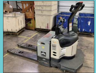
(2) 6,000 Lb. Crown Model PE-4500-60 Electric Rider Pallet Trucks