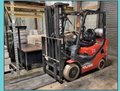
5,000 Lb. Tusk Model 500CG-16 LP Gas Lift Truck

(6) Sections 48" Deep X 8' Wide X 8' High Pallet Rack