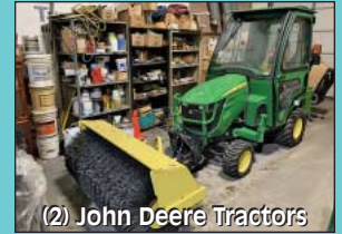
(2) John Deere Tractors