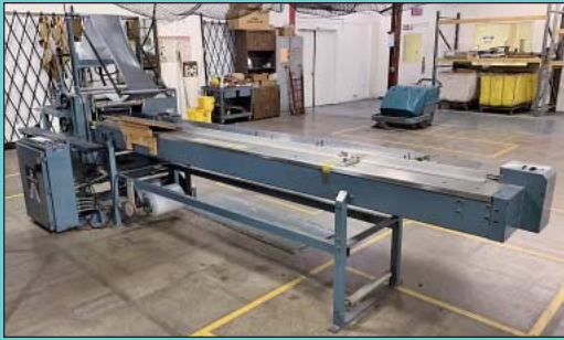
18" Wide Colony System Packaging Model 9000-18 Random Length Double Web Machine Poly Bagger