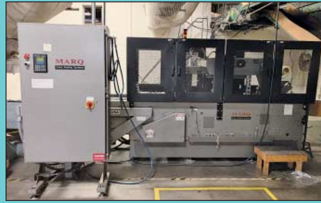
Marq Model HPR-HSS-FBD-SL/MW Random Case Sealer